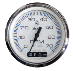
Suzuki Monitor Tachometer