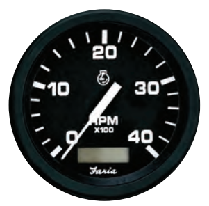
Tachometer with Digital Hourmeter