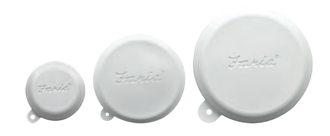
Covers - White CV0065, CV0069, CV0067