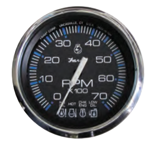
Suzuki Monitor Tachometer