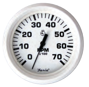
System Check Tachometer